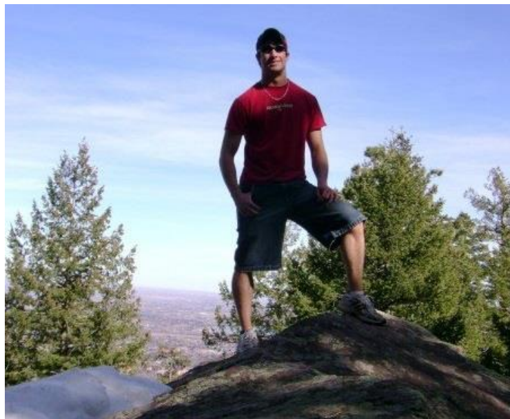
Hiking in Colorado, March 2007

At age 19, I was enjoying my first year of independence as a college freshman and exploring the budding start of my adulthood. I was doing well in school, had a steady girlfriend, good friends, and a healthy body thanks to a love of exercise and physical activity. I had grown up as a competitive swimmer since elementary school, spent a year in high school playing football, and loved finding ways to get outdoors in my home state of Colorado. One such love was snowboarding in the Rocky Mountains, which I did at least once a week to alleviate stress and immerse myself in nature. I would often go alone as a solitary meditation to clear my head with a prescription of crisp winter air and phenomenal views of pristine wilderness.