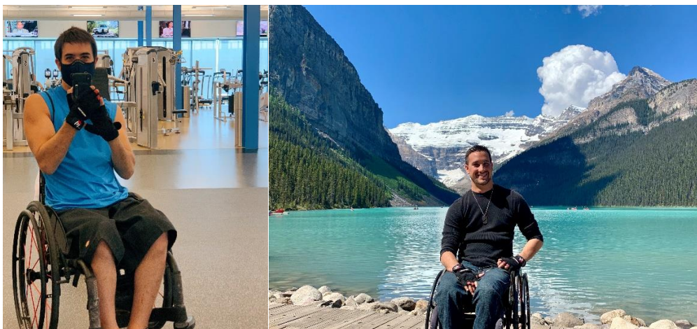
My wheelchair is no longer a symbol of what I cannot do, it is a symbol of what I have done.

After finishing law school, I found myself back in possession of an athlete's mindset but lacking the corresponding physique. Seven years of intensive studies brought a side effect of a neglected body, but seven years of intensive struggle delivered the game plan to change that. In 2016, I adopted a New Year's resolution to get back into the gym. I haven't looked back since, piling on nearly 30 pounds of muscle along the way.